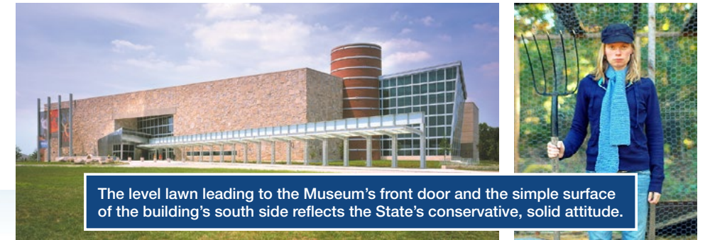
The level lawn leading to the Museum's front door and the simple surface of the building's south side reflects the State's conservative, solid attitude.

The Indiana State Museum's north and south sides reflect the various characteristics of the Hoosier personality.