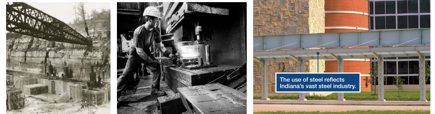
The "smokestack" element pays tribute to the State's industrial heritage.